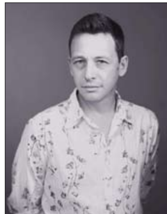
Silas House

The meeting, which will be open to the public, will be held at 7 p.m. at the Laurel Theater, at the corner of Laurel Avenue and 16 th Street (in Fort Sanders). A $1 donation is requested at the door. The building is handicapped accessible.